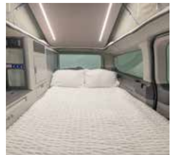
P\12 + LOWER BED