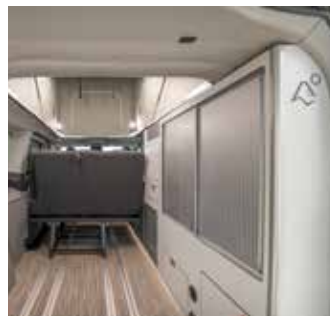
P\12 + REAR STORAGE