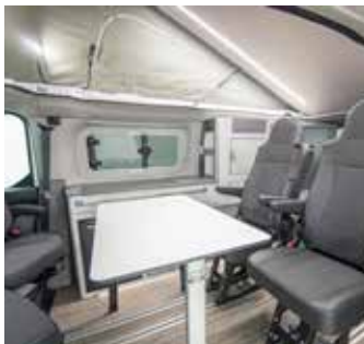
P\50 + DINING SPACE