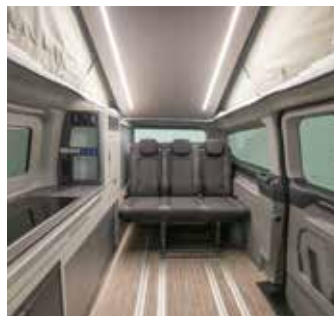
P\12 + REAR TRAVEL SEATS