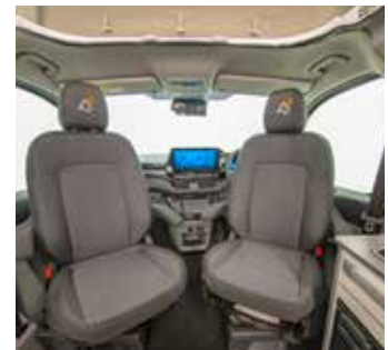
P\50 + SWIVEL CAB SEATS