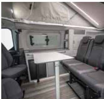
P\12 + INTERIOR