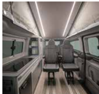
P\50 + REMOVEABLE TRAVEL SEATS