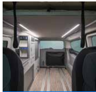
P\50 + SEATS REMOVED